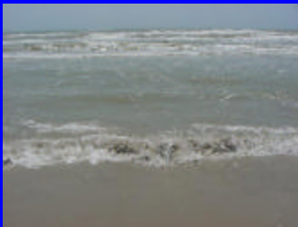
Texas Seashore is a nesting ground for Kemp's Ridley Sea turtle.

Summarize how your group believes we can help protect the Kemp's Ridley Sea Turtle. You might make this a bulleted list.