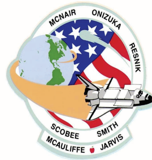
Scobee Elementary A TEA Exemplary School