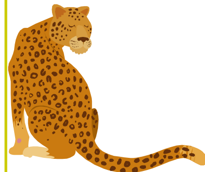
Pourquois stories give an imaginative reason for a natural occurrence.. e.g. How Leopards Got their Spots

Please do not park in the two spots marked "Teacher of the Week". Teachers only have the opportunity to have the space once during the school year.