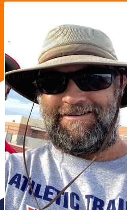
Meet Brandeis High School's Assistant Athletic Trainer