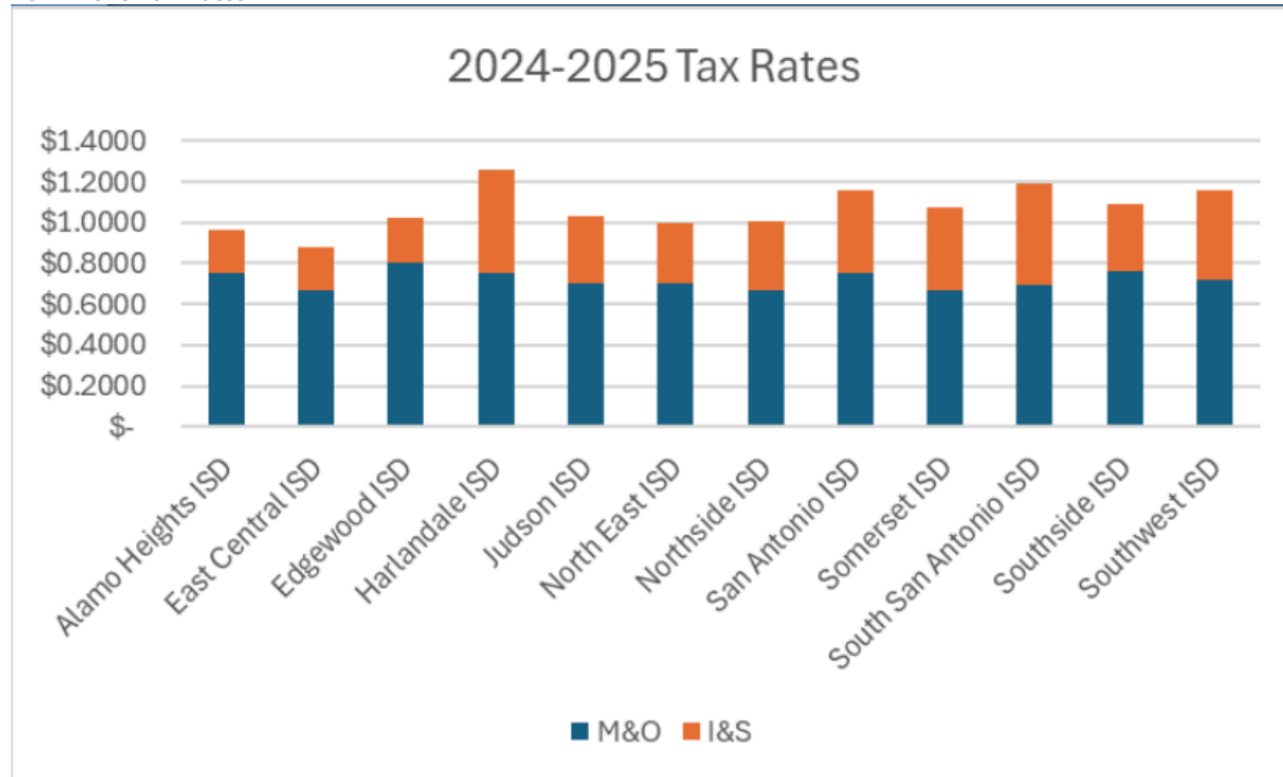
2024-2025 Tax Rates