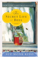
The Secret Life of Bees by Sue Monk Kidd