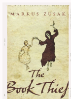
The Book Thief by Markus Zusak