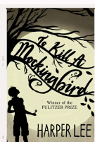
To Kill a Mockingbird by Harper Lee