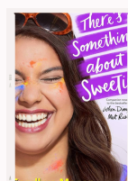
There's Something About Sweetie by Sandhya Menon

As you read, (1) consider the development of the main character and how their experiences help them understand the world and/or themselves in a new way; and (2) annotate, noting any passages you find interesting, significant, or memorable--for any reason at all. (Your annotations will not be graded, but they will help you as you begin to work with the book in class. Here is a document to help you keep track of things. It's only accessible by NISD email addresses.)