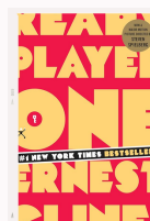
Ready Player One by Ernest Cline