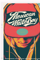
Mexican WhiteBoy by Matt de la Peña