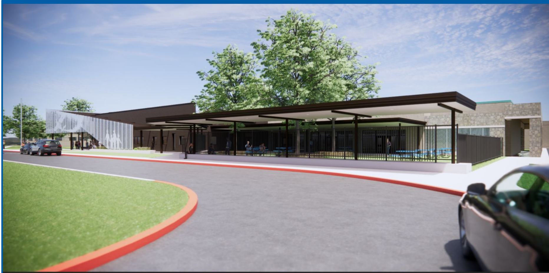
Stinson Magnet Middle School