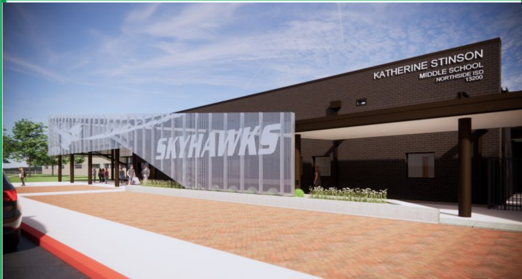
Stinson Magnet Middle School